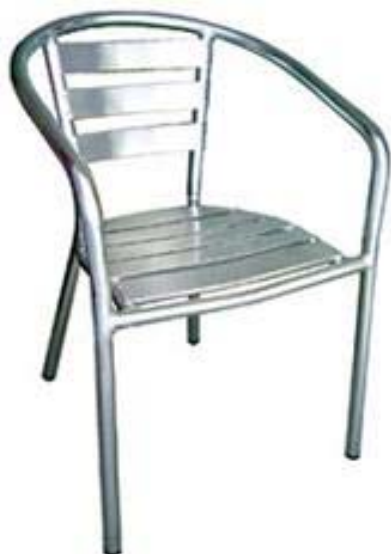
San Remo Aluminium