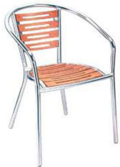
San Remo Wood