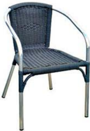
San Remo Rattan - Black