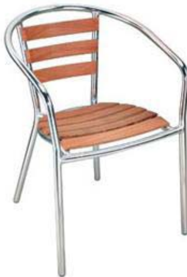
San Remo Wood