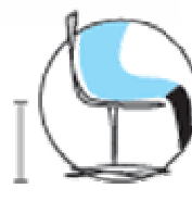
seat height 400