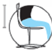
back rest height 420