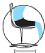
seat pan depth 420