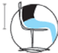
back rest height 370