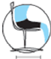
seat pan depth 430